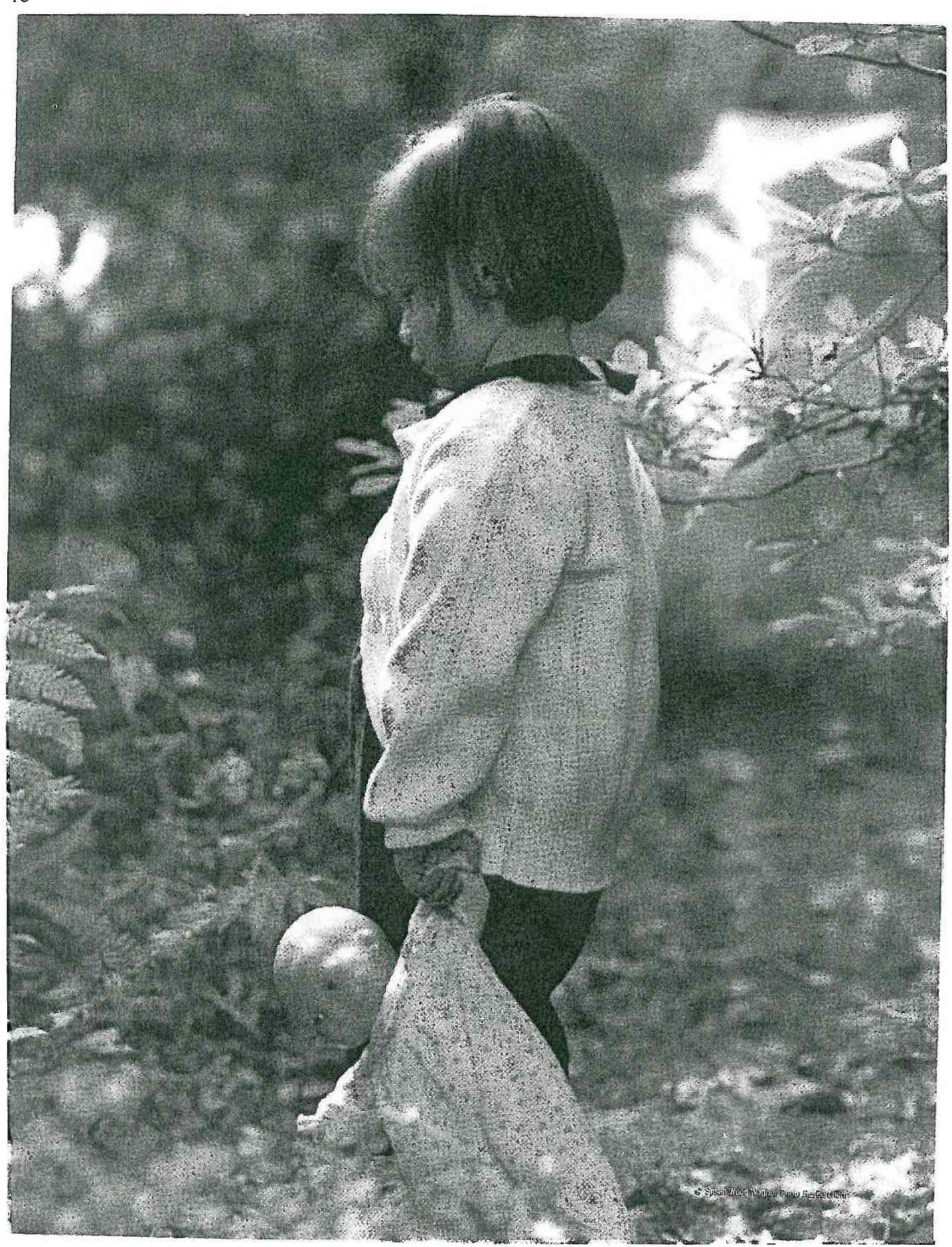
Reproduced with permission of the copyright owner. Further reproduction prohibited without permission.